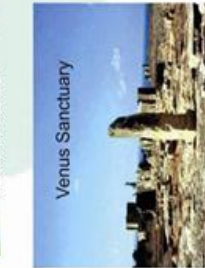
Baths of Venus